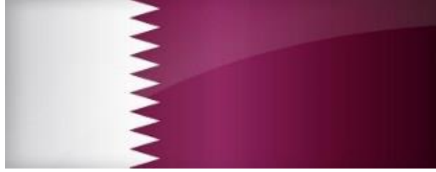
1 - QATAR NATIONAL IDENTITY

Our Vision and Mission are our most important guiding statements. They synthesize the aspirations we hold for our students during their time with us and beyond. With these as our chief goals, it is important that we measure our progress towards and achievement of them. In the coming days we will be inviting your feedback and your participation in school to help our evaluation process.