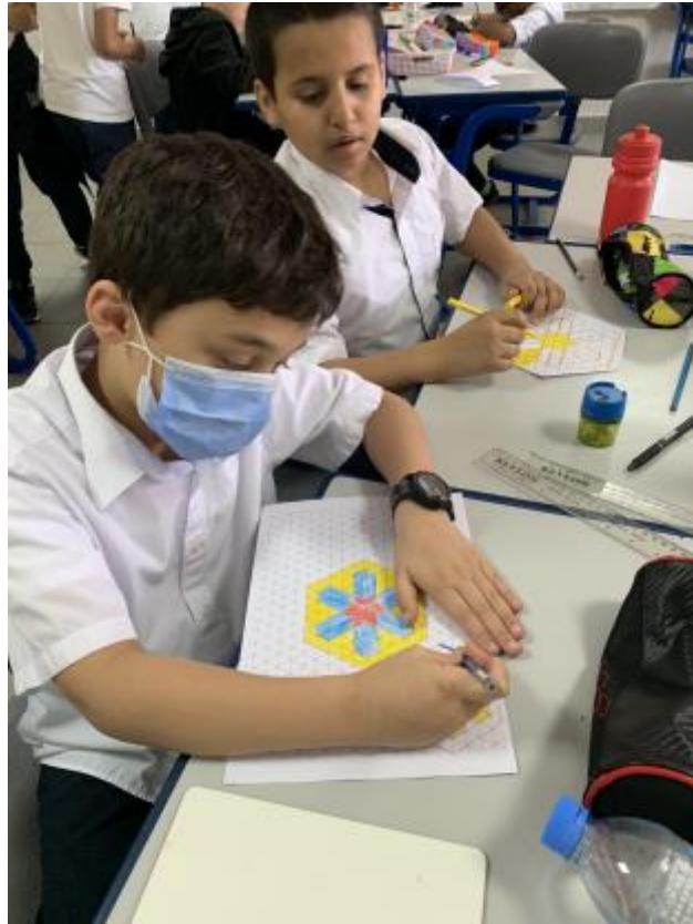
3 - 6-pointed stars inspired by a Masjid in Uzbekistan. This hexagram design appears in Islamic geometry and is known as "Seal of Sulaiman"