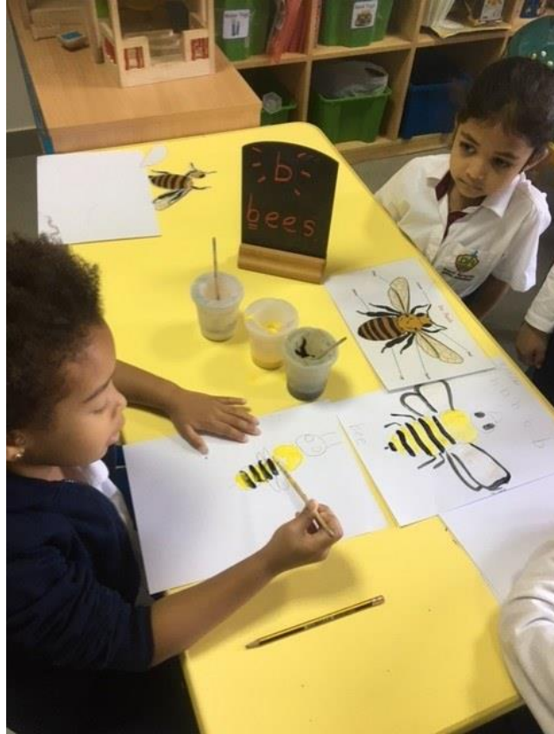
7 - Learning our phonics ...the 'b' sound!