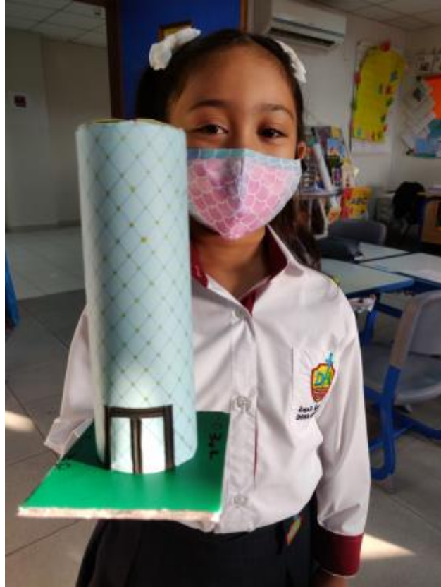
4 - 'Tornado Tower' for our project in Humanities .