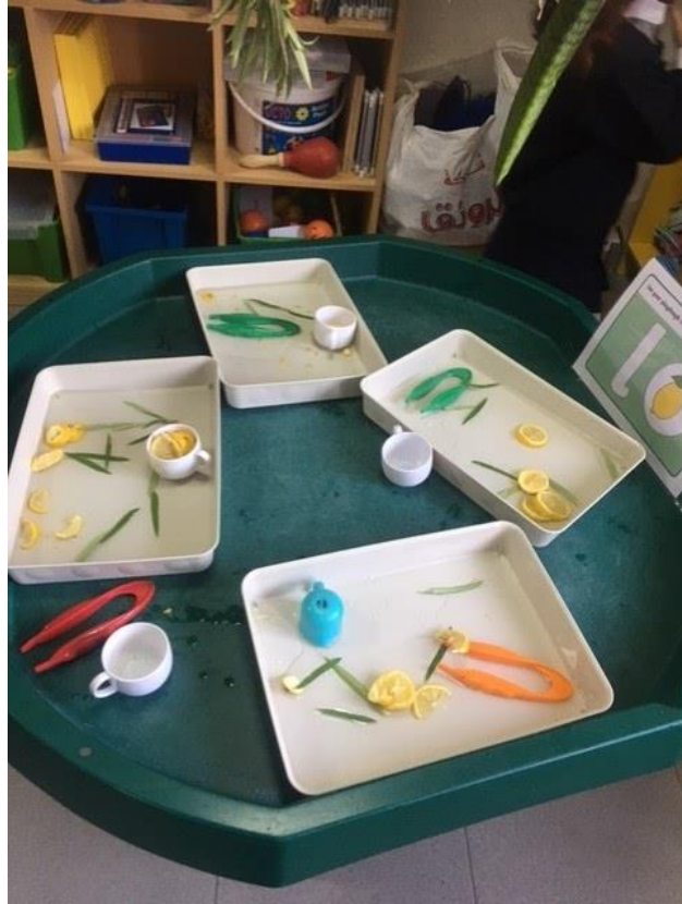
8 - Practical activities to help us remember our 'L' sound in phonics!