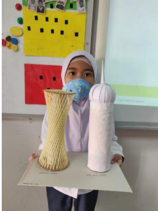
5 - Do you recognise these towers?