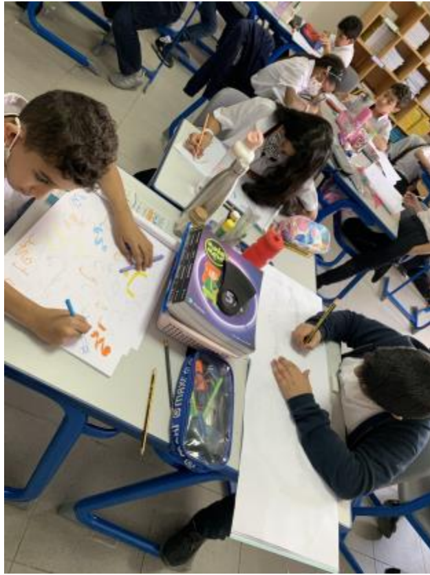
2 - Year 5 Art on Islamic Geometry