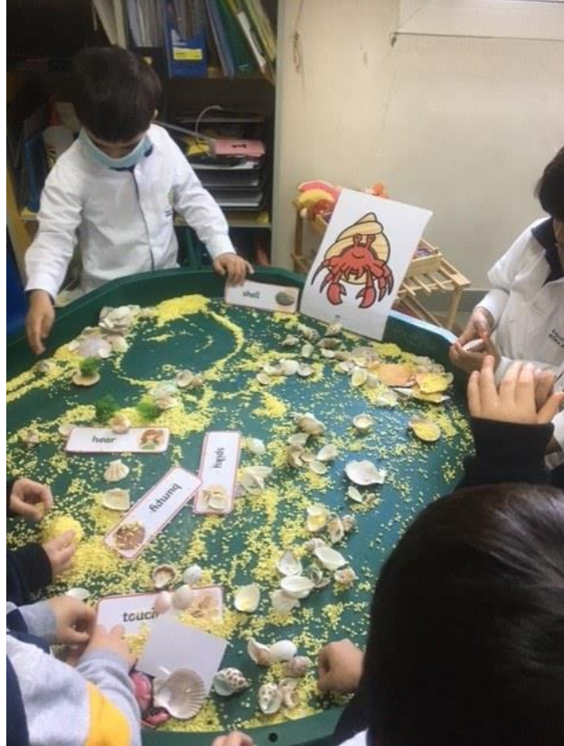
9 - Sharing a Shell- story by Julia Donaldson. We spoke about: shells- 'Sh' sound, crabs and how it feels to be kind!