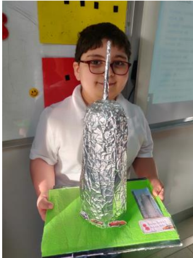
6 - Using different materials to create our own structures.