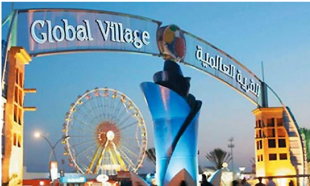
GLOBAL VILLAGE DAY