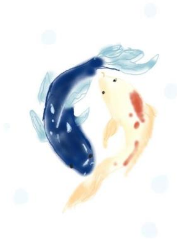
1 - Year 7 student achievement: Rumaysah Ahmed Year 7, applying arial perspective to create an artwork in digital media.